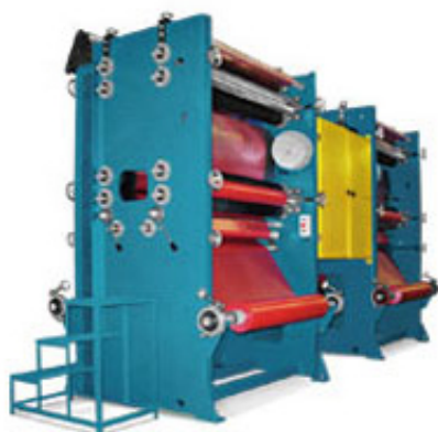
Film Slitting Extension Machine