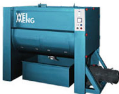
Plastic Resin Mixer