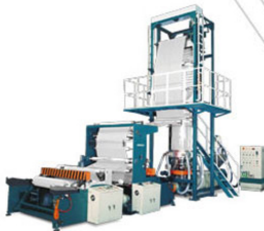
HDPE Blown Film Machine