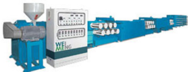
Monofilament Yarn Making Machine