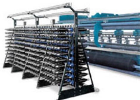
Creel Stand for Raschel Machine