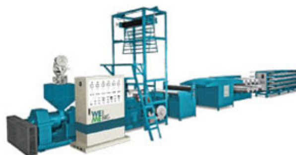
Flat Yarn Making Machine