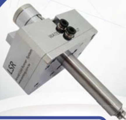
Coaxial shut-off module (Single Valve Gate cold runner system)