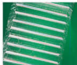
JS 602 "I" Shape Tetra Pack Straw Packing Machine