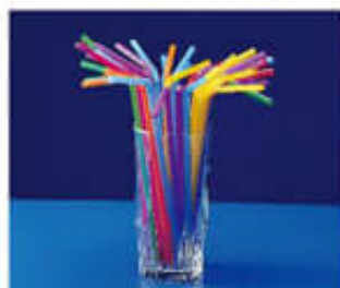
JS 168 Straw Bending Machine