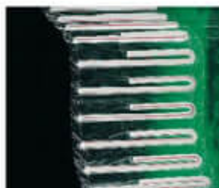
JS 602U "U" Shape Tetra Pack Straw Packing Machine