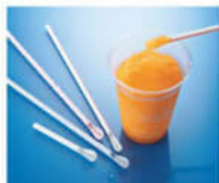
JS 612H Spoon Straw Making Machine