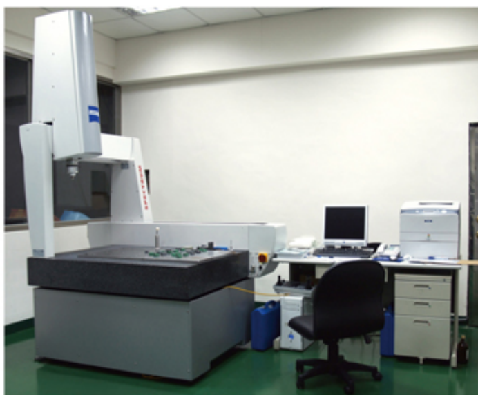
蔡司 ZEISS 3D 三次元檢測儀器

In order to ensure quality control of production processing, the company regularly performs SQL, CPK projects in random manufacturing products, develops boundary maps, function trees, list of quality characteristics, flowcharts, control schedules, operating instructions and control procedure charts to understand the range of tolerance limits, then further enhance processing capacity.