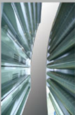
4) High jet nozzle drying system achieves high efficiency performance.

Worldly Industrial Co., Ltd. locate in Taichung Industry Park where is in the centre of Taiwan. Due to the attitude of insisting on high quality and taking responsibility for our customers, we develop and expand our manufacturing equipment continuously. Now we have achieved high production capacity & quality. All staff in Worldly contribute their abilities and devote themselves to satisfy with customers. We even encourage with our customers to establish good relationship and mutual benefit.