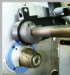
5) Flexible buckle can easily change the rubber roller.