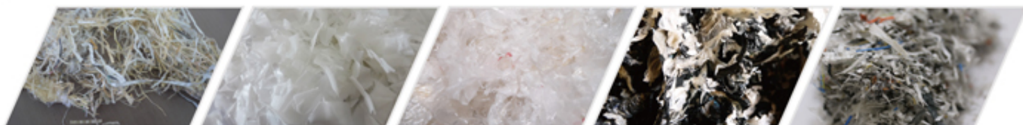
PP Jumbo bag