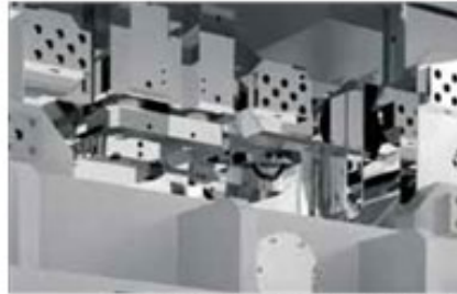
Patented 4-point clamping mechanism