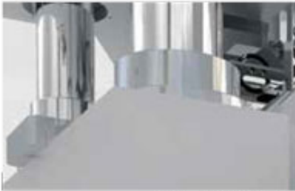
High rigidity body design

operations do matter the most. The Chudong SL series with high-precision mechanisms and high-efficiency control components can make perfect finished items under easy calibration in producing respective materials besides reliable and stable outputs for the maximal effects of our clients.