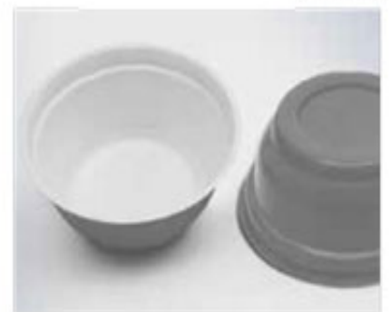
Instant noodle bowl